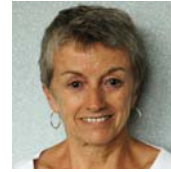
Professor Doreen Massey

‘What we need, it seems to me, is a global sense of the local, a global sense of place.’