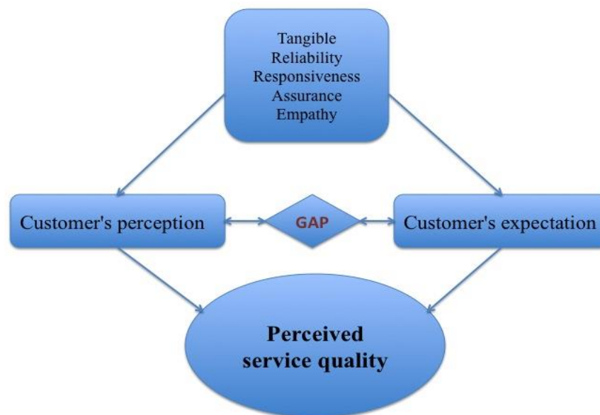
Figure 2.1: The relationship between customer perceptions and expectations towards perceived service quality