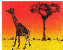
Savannah landscapes Blend sunsets and add silhouettes A creative project for Teach Primary magazine