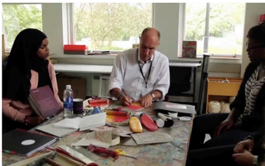
Printmaking: making press prints Three videos of a recent practical workshop with PGCE Primary Education students at Roehampton University Part 1 Part 2 Part 3