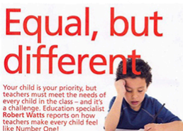
Equal but different Helping all children reach their potential An article for parenting magazine Right Start