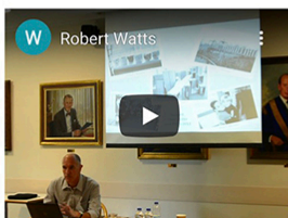
Understanding children's thinking about beauty: Images, interviews and Philosophy for Children Conference presentation at University of Surrey